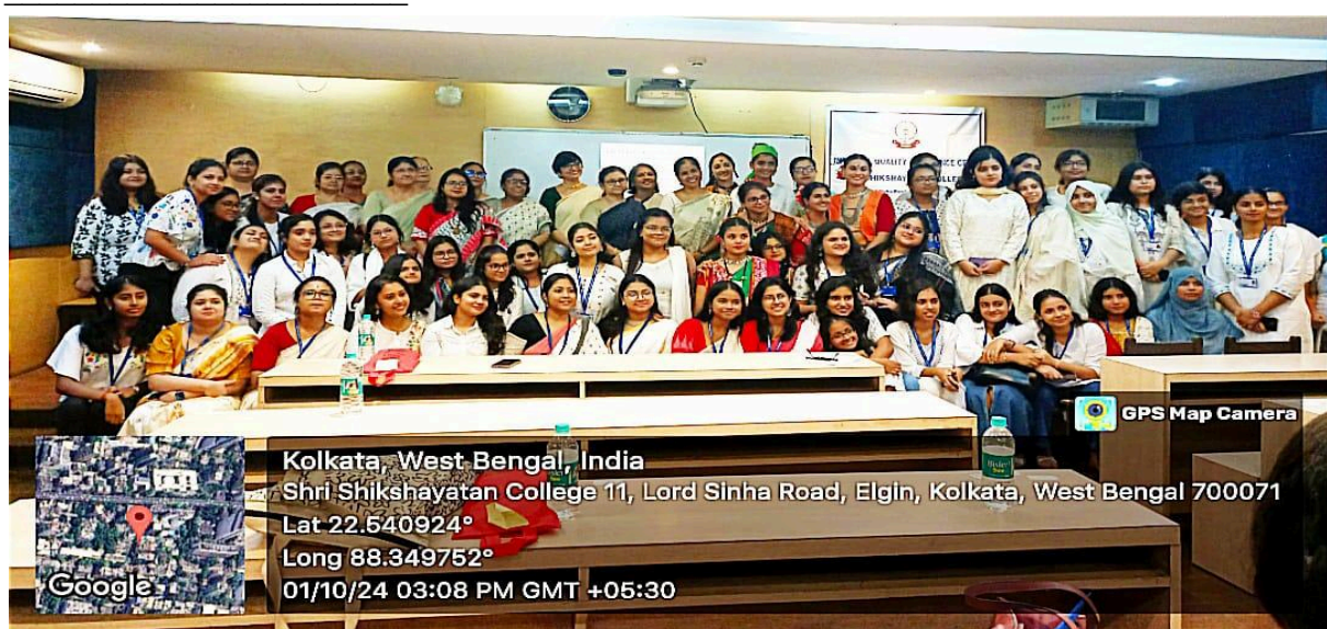
Fig 1: Collective photo of faculty members, resource persons, and students at the programme