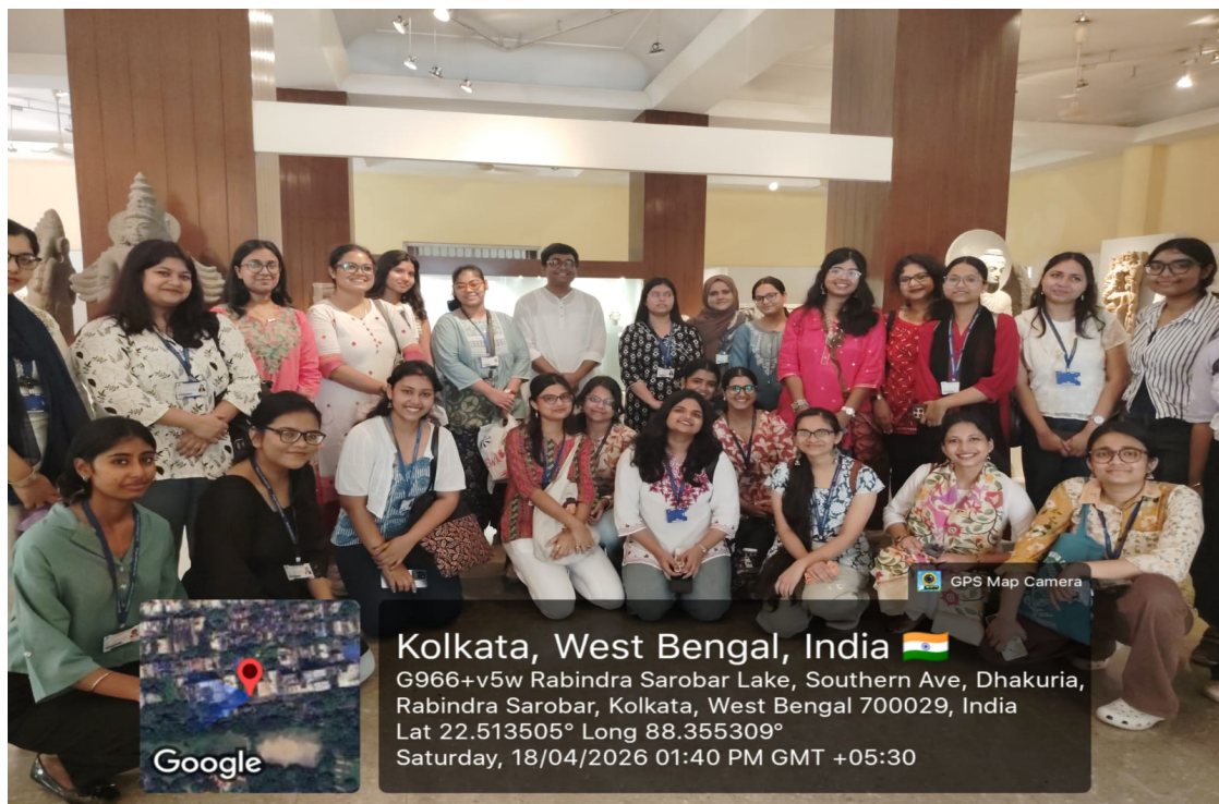
Fig 3: Group photo at the Ancient and Medieval Sculpture Gallery at the BAAC on 18 April 2026