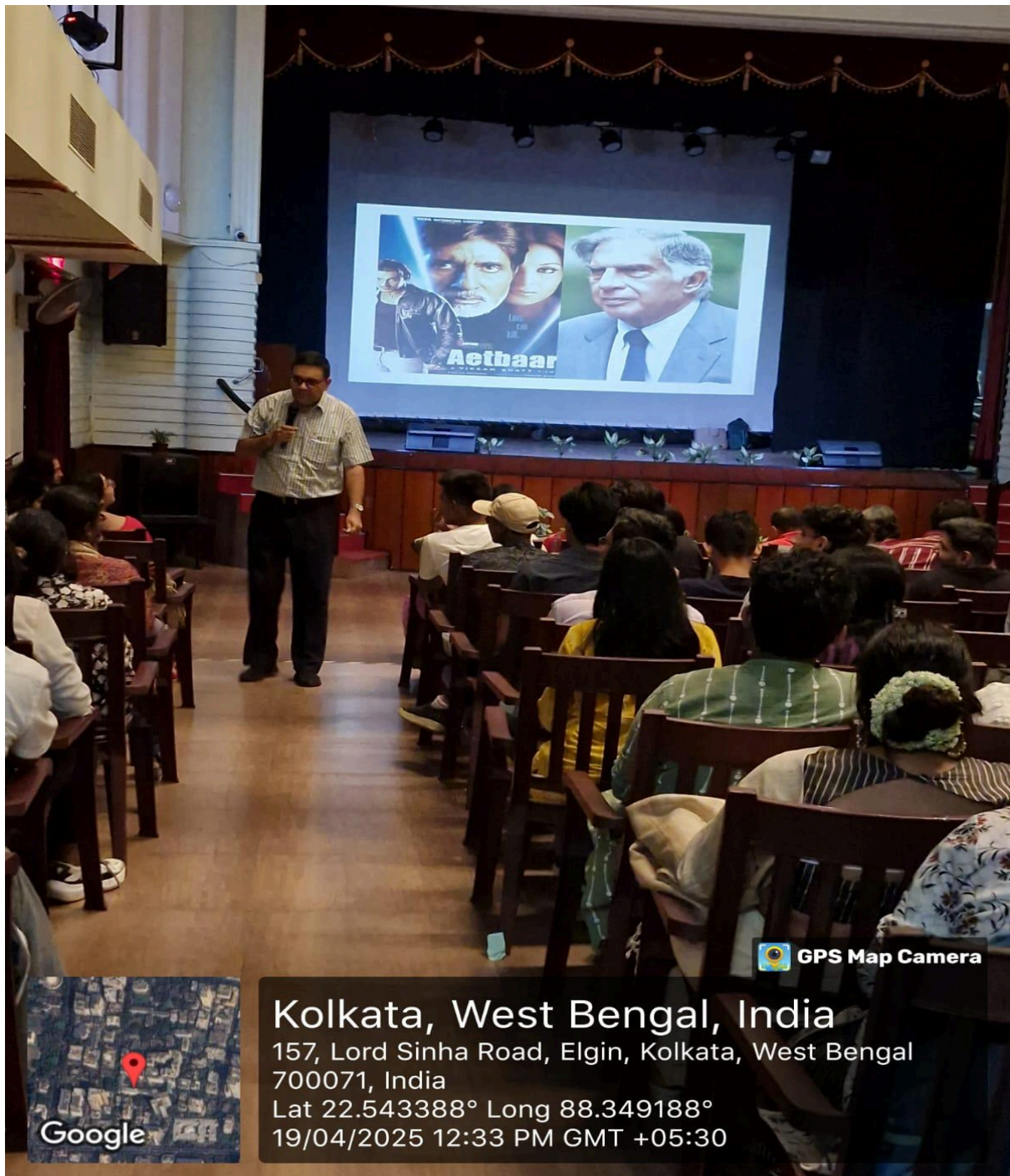
Fig 3: The quiz master in session