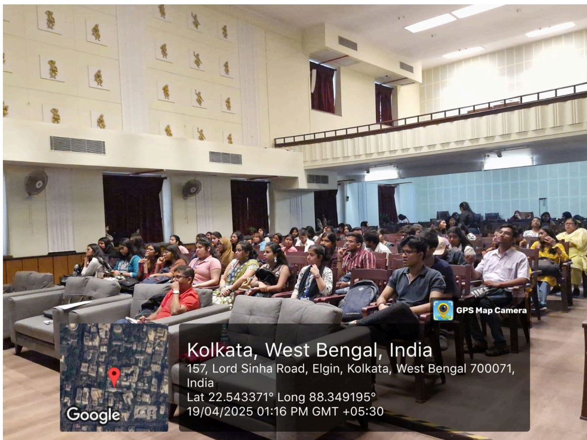
Fig5: Audience at the event