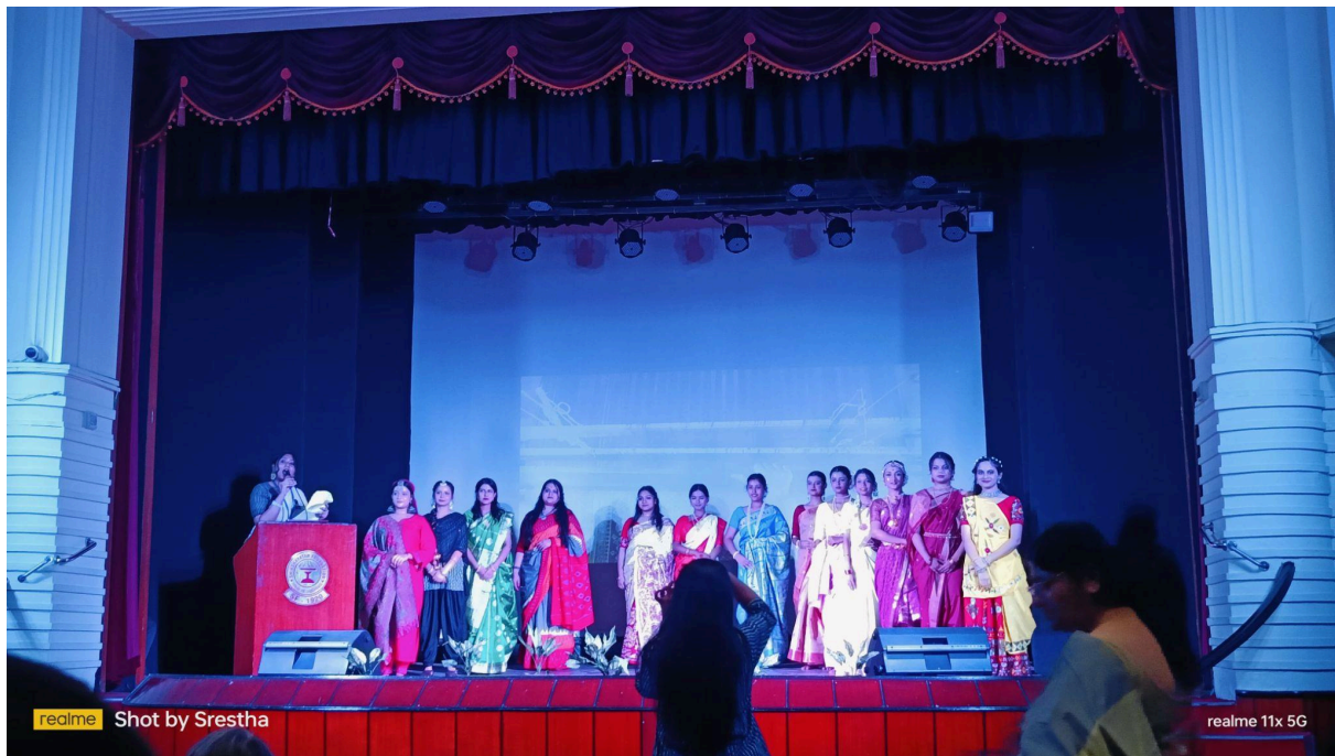
Fig 4: Showcasing India's Heritage through Textile Traditions by students of the Department