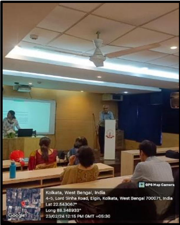
Kolkata, West Bengal, India 4-5, Lord Sinha Road, Elgin, Kolkata, West Bengal 700071, India Lat 22.543067° Long 88.348933° 23/02/24 12:15 PM GMT +05:30