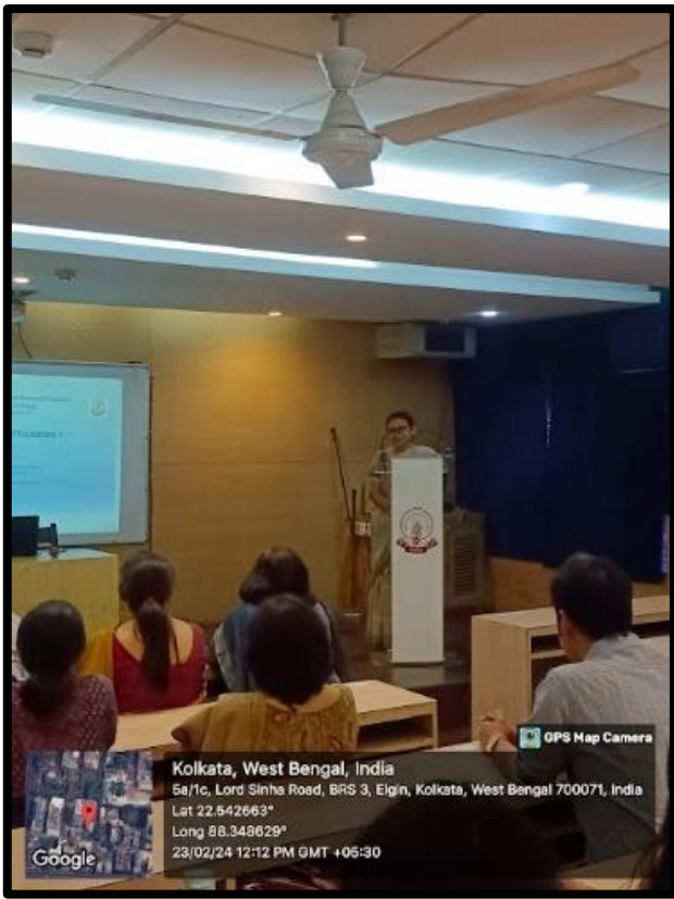
Kolkata, West Bengal, India 5a/1c, Lord Sinha Road, BRS 3, Elgin, Kolkata, West Bengal 700071, India Lat 22.542663° Long 88.348629° 23/02/24 12:12 PM GMT +05:30