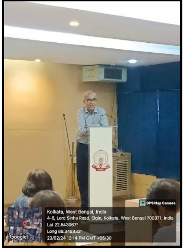
Kolkata, West Bengal, India 4-5, Lord Sinha Road, Elgin, Kolkata, West Bengal 700071, India Lat 22.543067° Long 88.348933° 23/02/24 12:14 PM GMT +05:30