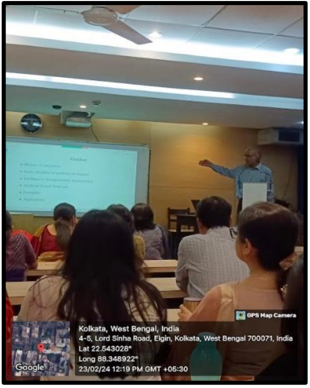
Kolkata, West Bengal, India 4-5, Lord Sinha Road, Elgin, Kolkata, West Bengal 700071, India Lat 22.543028° Long 88.348922° 23/02/24 12:19 PM GMT +05:30