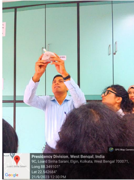
WORKSHOP IN PROGRESS